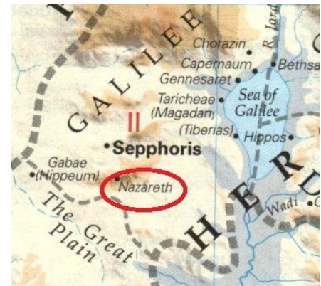
The time of Jesus

Vs 5 Joseph obeyed the governing powers of that time (Rom 13:1, Luke 20:25) and received a great blessing. Many Christians object to paying taxes today, but they do it because it’s the law. If we obey the powers that be ordained of God, we’ll be giving unto God the things that are God’s.